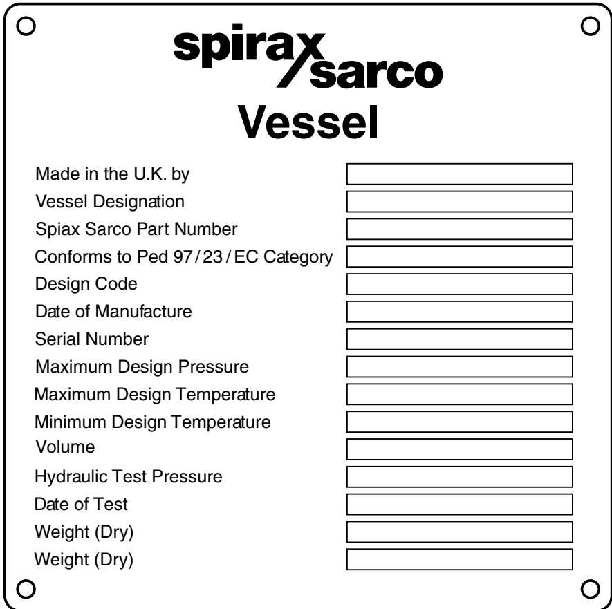
Fig. 2 Typical FV type flash vessel name-plate details

Note: These vessels will withstand full vacuum conditions.