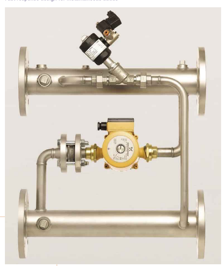
Commissioning a positioner component of the QuickHeat